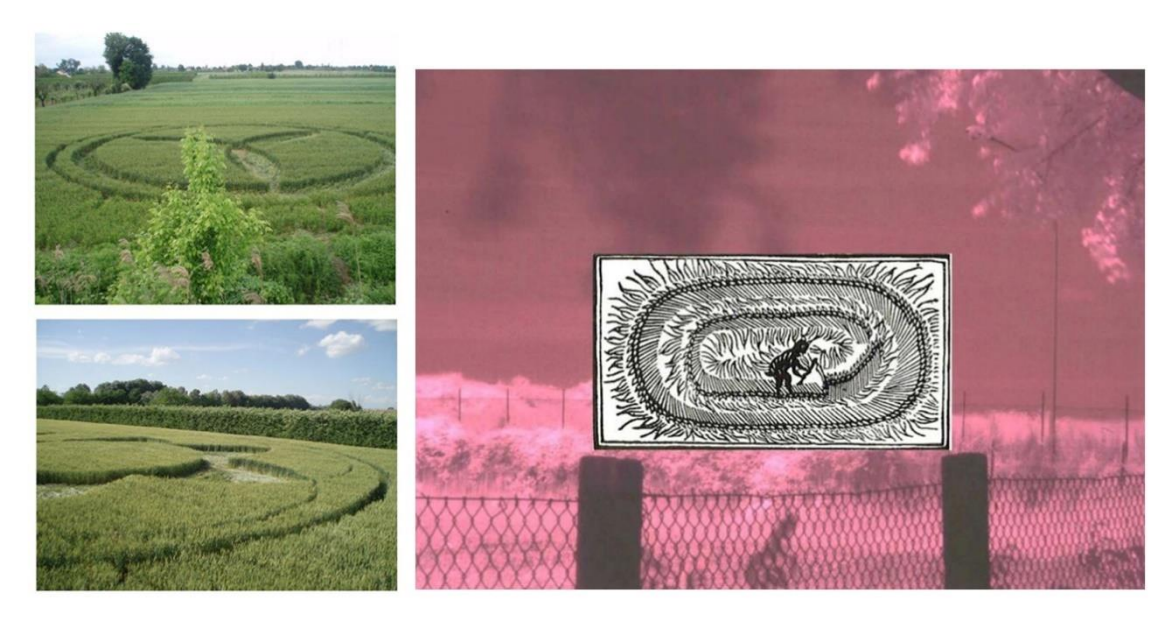
Figure 1. Left . Crop circle close to the main cemetery in Forlì (Emilia-Romagna, North Italy). The pictogram appeared in spring 2007. Right . My infrared photo taken just out of the entrance to the field where the pictogram was located.

What did I learn from this? Literally nothing scientifically, but this coincidence is truly shocking and probably not random. It seemed to be an aimed message telling me that the idea of extraterrestrials making a crop circle using a microwave beam (as some still believe) from their UFO – although scientific per se – is just an anthropomorphic hypothesis and probably even naive. I feel that the reality behind UFOs and crop circles is largely bigger than our limited mind may suggest to us. There might be a so-called "non-local intelligence" that wants to communicate with our subconscious using synchronicities, symbols or even pareidolia. I can only acknowledge this, but my rational mind is not able to decode it. Maybe I will leave it to my subconscious hoping that it has covertly shaped something of my consciousness.